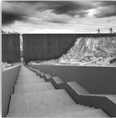
Monumental concrete stairs, and corroded wall