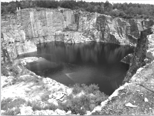
The quarry – place of implementation of the project (contemporary view)